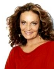
Diane Von Furstenberg